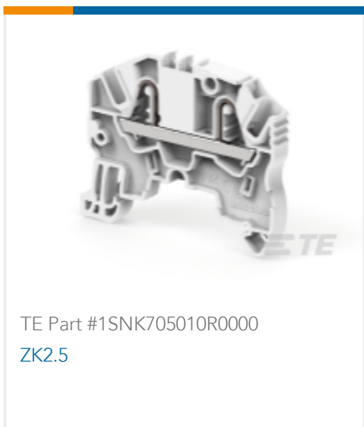
TE Part #1SNK705010R0000 ZK2.5