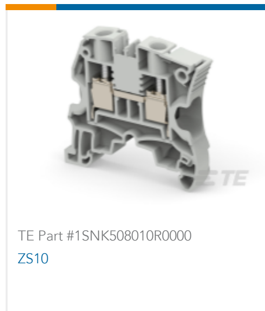
TE Part #1SNK508010R0000 ZS10