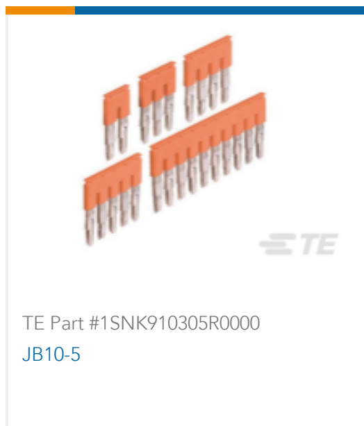
TE Part #1SNK910305R0000 JB10-5