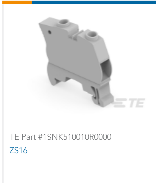
TE Part #1SNK510010R0000 ZS16