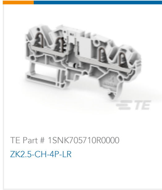
TE Part # 1SNK705710R0000 ZK2.5-CH-4P-LR