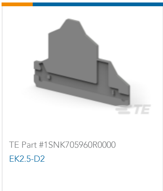
TE Part #1SNK705960R0000 EK2.5-D2