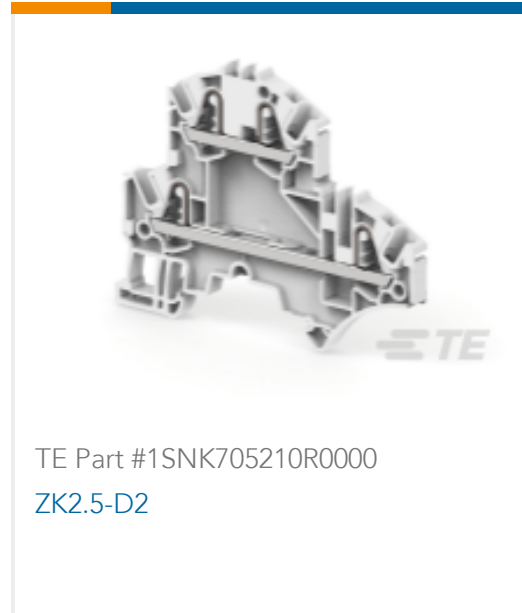
TE Part #1SNK705210R0000 ZK2.5-D2