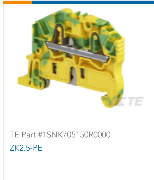
TE Part #1SNK705150R0000 ZK2.5-PE