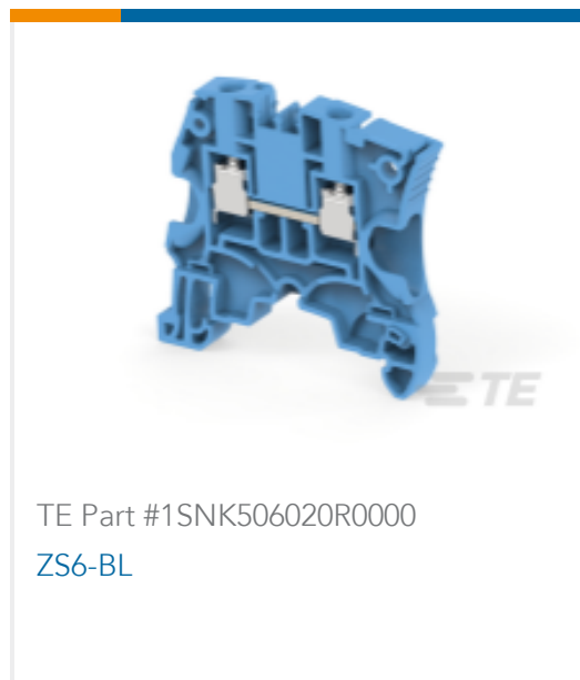
TE Part #1SNK506020R0000 ZS6-BL