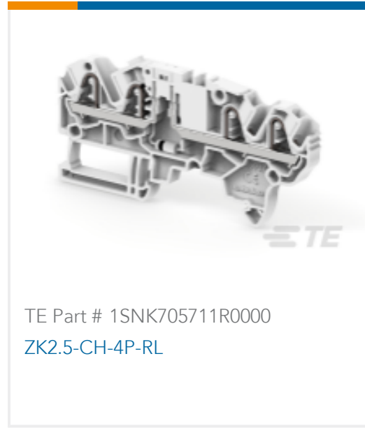
TE Part # 1SNK705711R0000 ZK2.5-CH-4P-RL