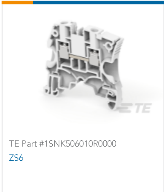
TE Part #1SNK506010R0000 ZS6