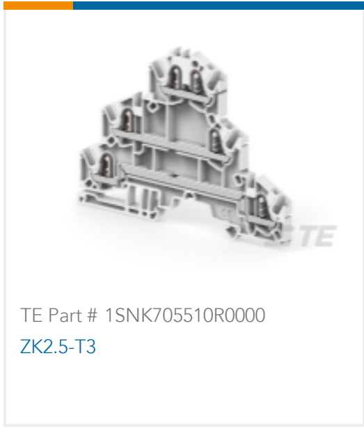
TE Part # 1SNK705510R0000 ZK2.5-T3