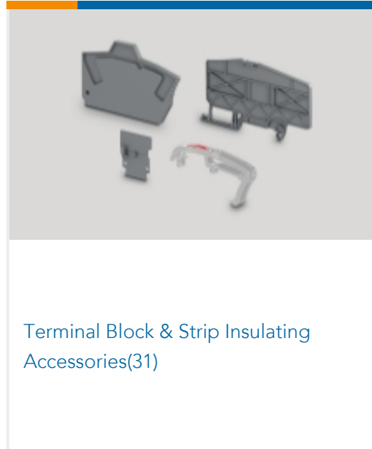
Terminal Block & Strip Insulating Accessories(31)