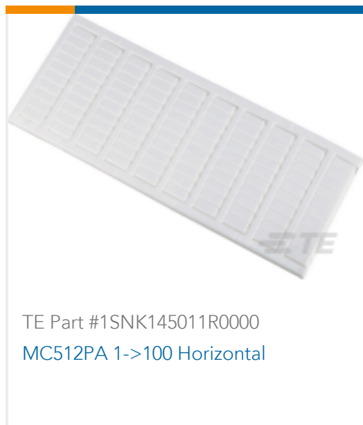
TE Part #1SNK145011R0000 MC512PA 1->100 Horizontal