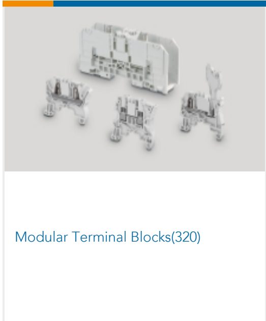
Modular Terminal Blocks(320)