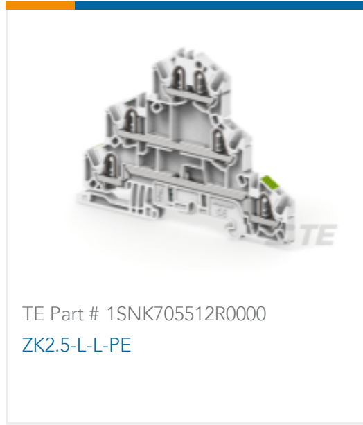
TE Part # 1SNK705512R0000 ZK2.5-L-L-PE