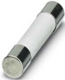
Fuses for ME-ELR module electronics (Midget/ 10.3 x 38)

Please be informed that the data shown in this PDF Document is generated from our Online Catalog. Please find the complete data in the user's documentation. Our General Terms of Use for Downloads are valid ( http://phoenixcontact.com/download )