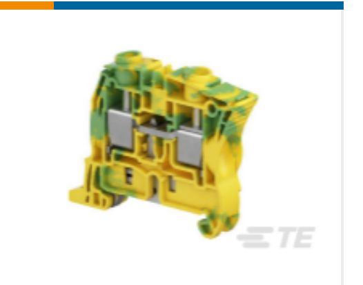
TE Part # 1SNK510150R0000 ZS16-PE