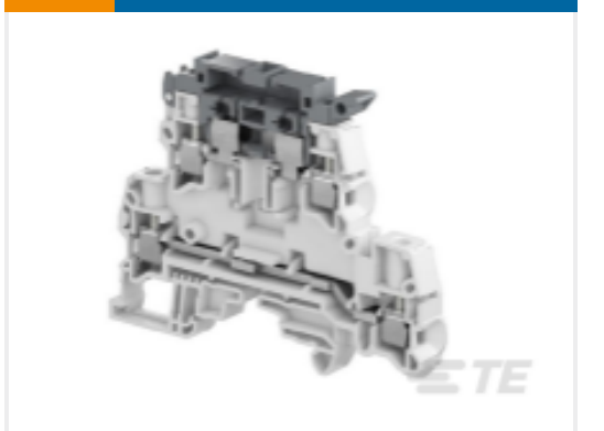
TE Part # 1SNK508425R0000 ZS4-D2-SF1