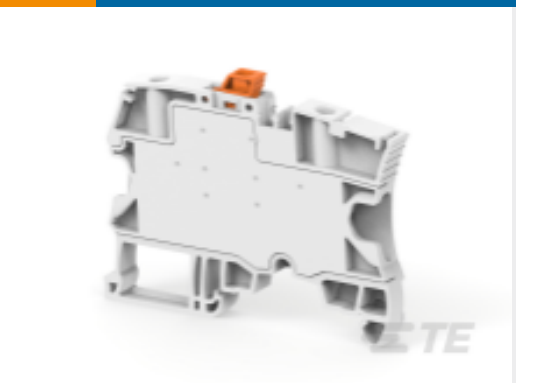
TE Part # 1SNK506310R0000 ZS4-S-R1