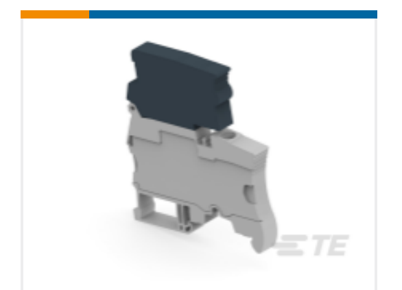
TE Part # 1SNK508418R0000 ZS10-SF