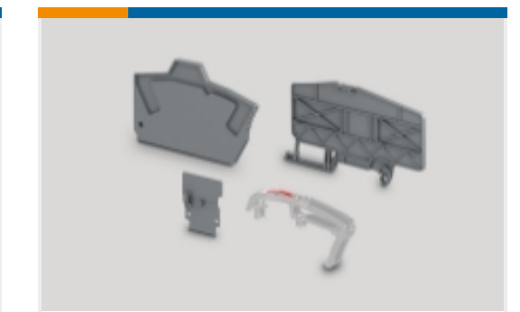
Terminal Block & Strip Insulating Accessories(31)