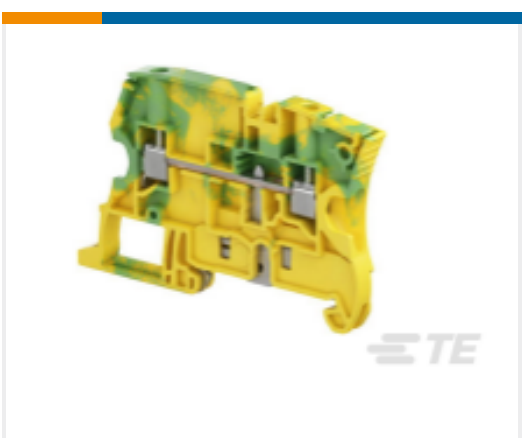
TE Part # 1SNK506153R0000 ZS4-PE-R2