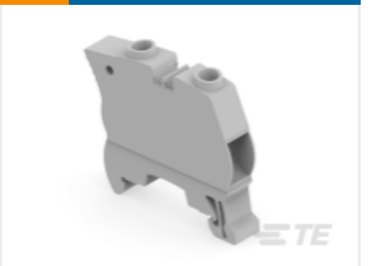
TE Part # 1SNK510010R0000 ZS16