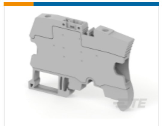
TE Part # 1SNK506013R0000 ZS4-R2