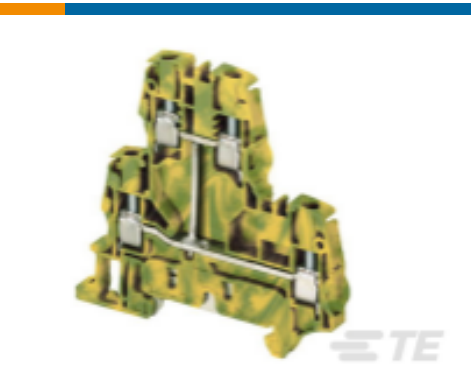
TE Part # 1SNK506250R0000 ZS6-D1-PE