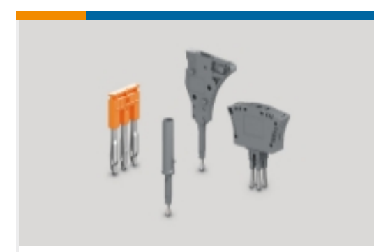
Terminal Block & Strip Conducting Accessories(67)