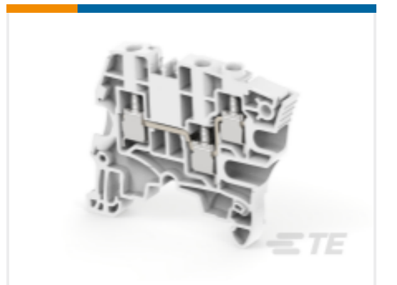
TE Part # 1SNK506011R0000 ZS6-3S