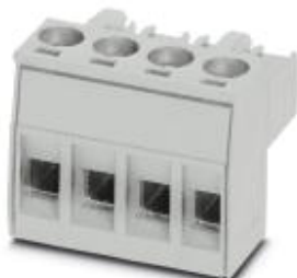
PCB connector, number of positions: 4, pitch: 5 mm, color: light gray

Please be informed that the data shown in this PDF Document is generated from our Online Catalog. Please find the complete data in the user's documentation. Our General Terms of Use for Downloads are valid ( http://phoenixcontact.com/download )