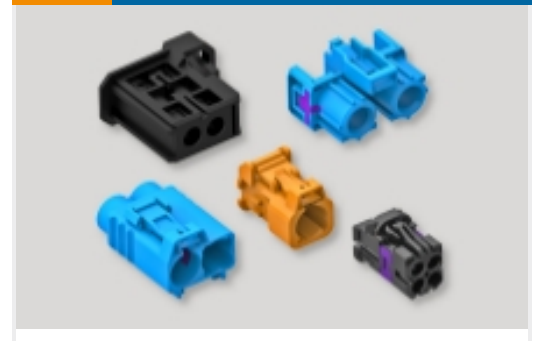
Data Connectivity Housings(3)