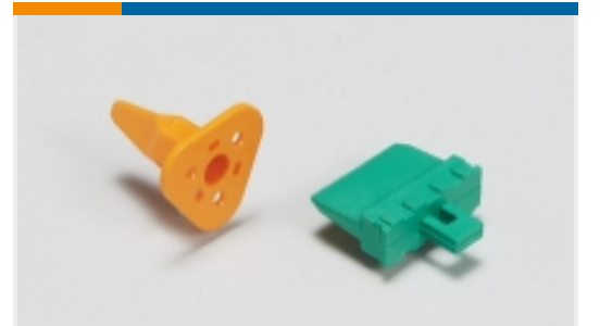
Automotive Connector Locks & Position Assurance(2)