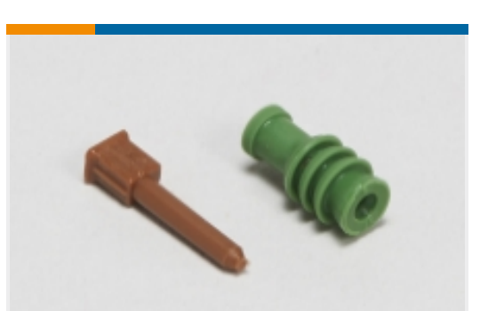
Automotive Seals & Cavity Plugs(4)