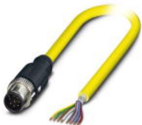
Sensor/actuator cable, 8-position, PVC, yellow, shielded, Plug straight M12 SPEEDCON, A-coded, on free cable end, cable length: 5 m

Please be informed that the data shown in this PDF Document is generated from our Online Catalog. Please find the complete data in the user's documentation. Our General Terms of Use for Downloads are valid ( http://phoenixcontact.com/download )