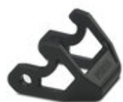
Replacement latch for HC-D7 housing

Housing brackets - HC-D07-SL-PLBK - 1424440