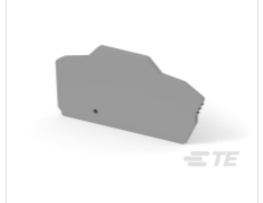
TE Part #1SNK705911R0000 EK2.5-3P