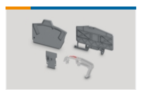
Terminal Block & Strip Insulating Accessories(31)