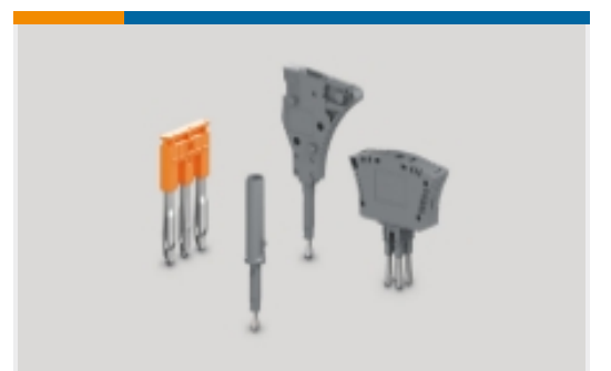
Terminal Block & Strip Conducting Accessories(67)