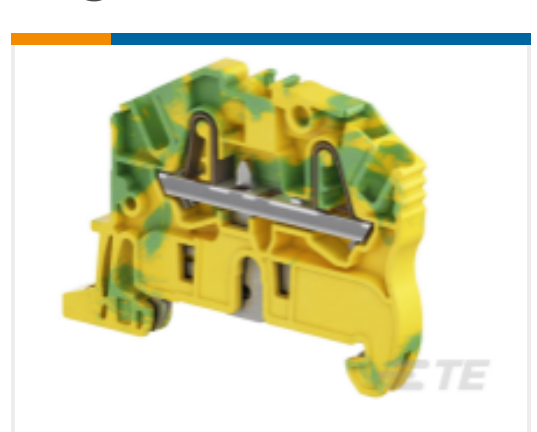
TE Part #1SNK705150R0000 ZK2.5-PE