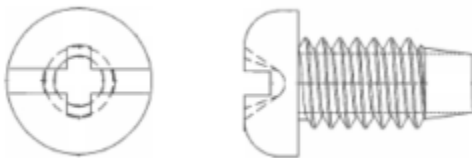
Original Ground Screw