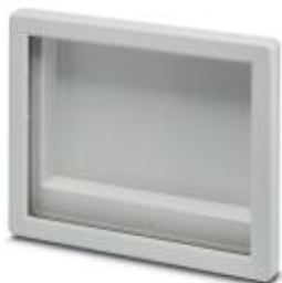
Display housing, 15", light gray, central window, front level, consisting of two half shells with screws

Please be informed that the data shown in this PDF Document is generated from our Online Catalog. Please find the complete data in the user's documentation. Our General Terms of Use for Downloads are valid ( http://phoenixcontact.com/download )