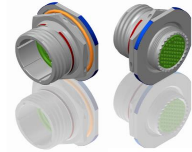
LAYOUT SHOWN AS EXAMPLE