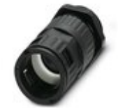
Cable gland, Pg thread, IP66 protection, with strain relief

Screw connection - WP-GR HF IP66 PG29 BK - 3240949