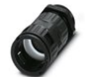
Cable gland, Pg thread, IP68/69k protection, with strain relief

Screw connection - WP-GR HF IP69K PG29 BK - 3240935