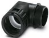
Cable gland, Pg thread, IP68/69k protection, angled

Screw connection - WP-GA HF IP69K PG29 BK - 3240907