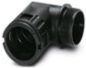
Cable gland, Pg thread, IP66 protection, angled

Screw connection - WP-GA HF IP66 PG29 BK - 3240921