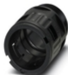
Cable gland, Pg thread, IP66 protection, straight

Screw connection - WP-G HF IP66 PG29 BK - 3240893