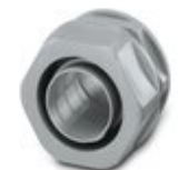
Cable gland made from PP with Pg thread, IP65 protection

Screw connection - WP-G PP HF PG29 - 3240993