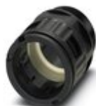
Cable gland, Pg thread, IP68/69k protection, straight

Screw connection - WP-G HF IP69K PG29 BK - 3240879