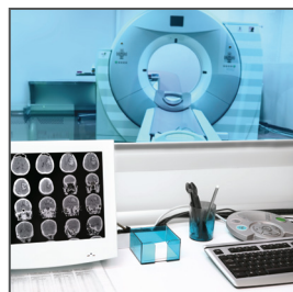
Medical Diagnostic Equipment