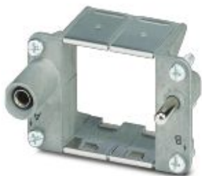
Module carrier frame, size: B6, type : for the sleeve side (A, B, C, ...), 4 mm 2 ... 6 mm 2 , application: Module carrier frame

Please be informed that the data shown in this PDF Document is generated from our Online Catalog. Please find the complete data in the user's documentation. Our General Terms of Use for Downloads are valid ( http://phoenixcontact.com/download )