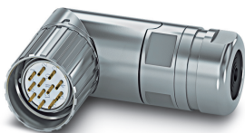
The figure shows the 12-pos. product version with solder contacts

Cable connector, CA, angled, shielded: yes, Screw locking, M23, No. of pos.: 16, type of contact: Pin, Crimp connection, cable diameter range: 10 mm ... 14.5 mm, coding:N