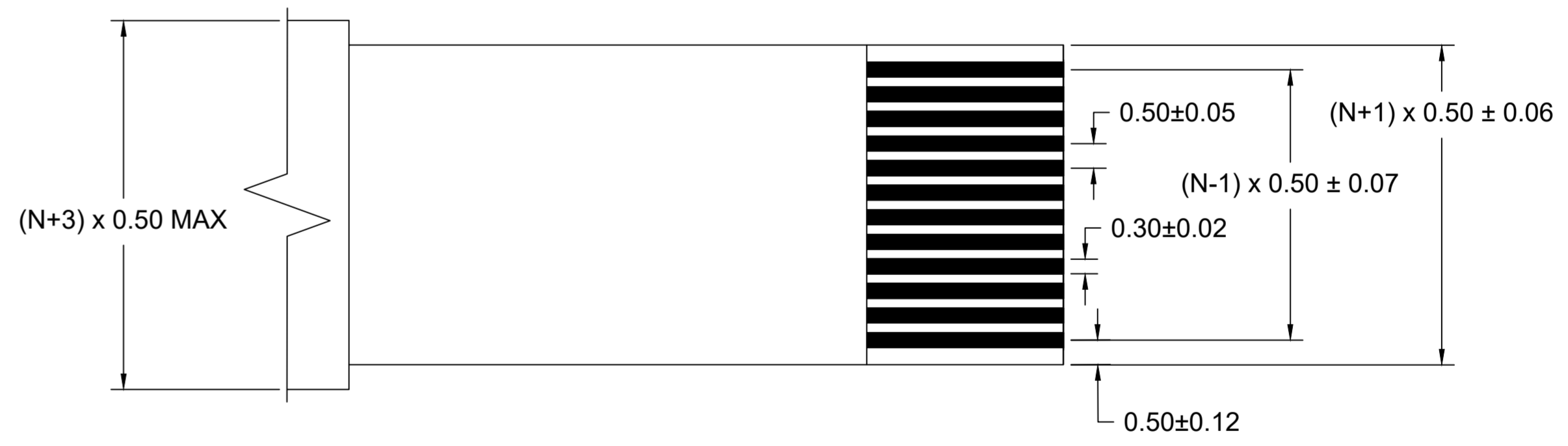
END-TAIL DIMENSIONS SCALE 10:1