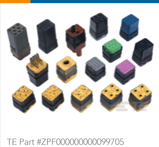
DMC-M 99-01 BN