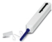
Ferrule cleaner, 1.25 mm, for LC, approx. 500 cleaning cycles

FO accessories - FOC-TOOL-FERRULECLEANER-1.25 - 1407032