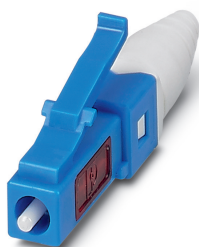
LC connector, with short bend protection (pigtail), for single mode 9/125 µm, PC polishing, blue

Please be informed that the data shown in this PDF Document is generated from our Online Catalog. Please find the complete data in the user's documentation. Our General Terms of Use for Downloads are valid ( http://phoenixcontact.com/download )