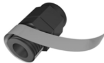
Figure 2. Watertight glands wrapped in PTFE tape

Seal any unused access holes with one of the supplied plastic plugs. To install a watertight plug: