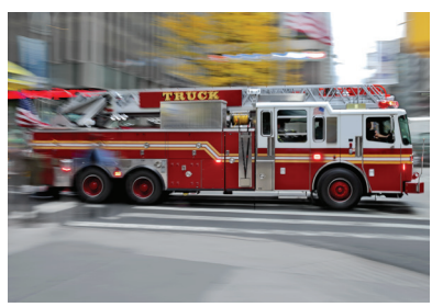
When hose and wire protection is critical, you can depend on Techflex to find the right