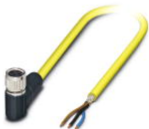
Sensor/actuator cable, 3-position, PVC, yellow, shielded, free cable end, on Socket angled M8, cable length: 5 m

Please be informed that the data shown in this PDF Document is generated from our Online Catalog. Please find the complete data in the user's documentation. Our General Terms of Use for Downloads are valid ( http://phoenixcontact.com/download )