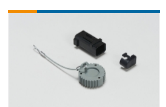
Automotive Connector Caps & Covers (107)