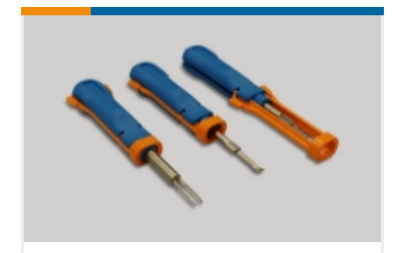
Insertion & Extraction Tools(3)