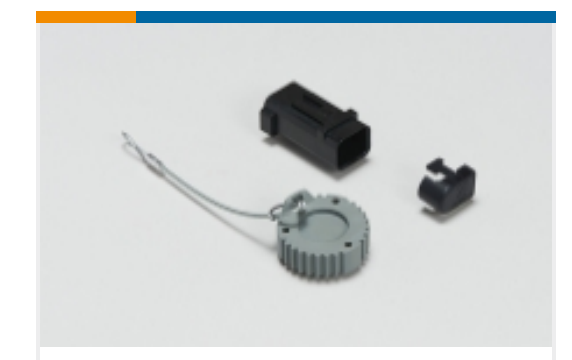
Automotive Connector Caps & Covers (41)