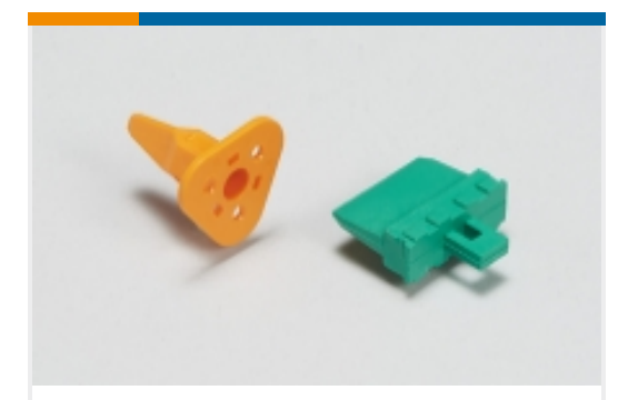
Automotive Connector Locks & Position Assurance(17)