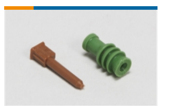
Automotive Seals & Cavity Plugs(5)