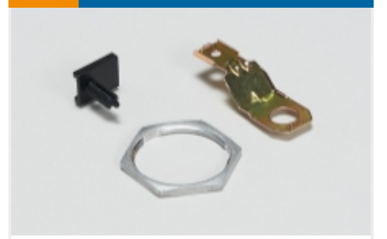
Other Automotive Connector Accessories(16)