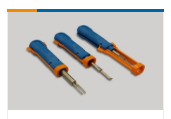
Insertion & Extraction Tools(2)