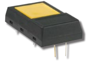
JF Series full face illuminated tactiles will have LED revisions.

The LED specifications for JF Series full face illuminated tactile switches will be undergoing changes. This will result in revisions to the electrical values, and will apply to yellow and green LEDs for standard or custom switches. Following is the comparison between the specifications before and after the changes. Effected standard part numbers are shown below.