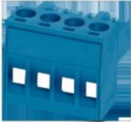
PCB connector, number of positions: 4, pitch: 5 mm

Please be informed that the data shown in this PDF Document is generated from our Online Catalog. Please find the complete data in the user's documentation. Our General Terms of Use for Downloads are valid ( http://phoenixcontact.com/download )