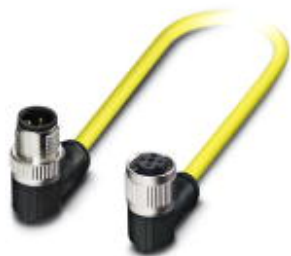
Sensor/actuator cable, 4-position, PVC, yellow, Plug angled M12 SPEEDCON, A-coded, on Socket angled M12 SPEEDCON, A-coded, cable length: 0.5 m

Please be informed that the data shown in this PDF Document is generated from our Online Catalog. Please find the complete data in the user's documentation. Our General Terms of Use for Downloads are valid ( http://phoenixcontact.com/download )