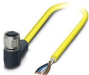
Sensor/actuator cable, 5-position, PVC, yellow, shielded, free cable end, on Socket angled M12 SPEEDCON, A-coded, cable length: 10 m

Please be informed that the data shown in this PDF Document is generated from our Online Catalog. Please find the complete data in the user's documentation. Our General Terms of Use for Downloads are valid ( http://phoenixcontact.com/download )