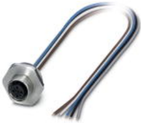
Sensor/actuator flush-type socket, 8-pos., M12, A-coded, front/screw mounting with M20 x 1.5 thread, with 0.5 m TPE litz wire, 8 x 0.25 mm 2 , brass version

Please be informed that the data shown in this PDF Document is generated from our Online Catalog. Please find the complete data in the user's documentation. Our General Terms of Use for Downloads are valid ( http://phoenixcontact.com/download )