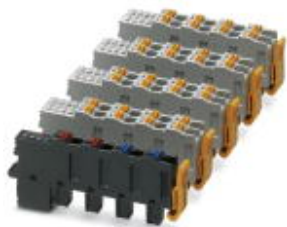
Axioline F connector set (for e.g., AXL F A18 1F, AXL F AO8 1F)

Please be informed that the data shown in this PDF Document is generated from our Online Catalog. Please find the complete data in the user's documentation. Our General Terms of Use for Downloads are valid ( http://phoenixcontact.com/download )