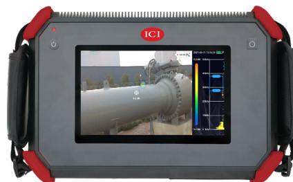
Sound Detect Pro

Constructed with 128 individual microphones, the ATEX certified explosion-proof Sound Detect Pro leverages ultrasonic frequencies and microphone array beamforming technology to quickly detect potential air, gas, and vacuum leaks in noisy industrial environments. Also find partial discharge faults from electrical devices. The Sound Detect Pro displays information related to partial discharge type, estimated leak size, and earnings loss values. The camera also comes with a built-in processor that pinpoints a leak's location on-screen. Real-time sound image display, assists users in detecting hazards significantly faster compared to previous methods. Does not include Wi-Fi or Bluetooth.