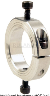
*Additional hardware NOT included