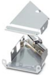
D-SUB EMC inner sleeve, shell size 3, for sleeve housing VS-25-...

Please be informed that the data shown in this PDF Document is generated from our Online Catalog. Please find the complete data in the user's documentation. Our General Terms of Use for Downloads are valid ( http://download.phoenixcontact.com )