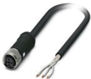
Sensor/actuator cable, 3-position, PE-X halogen-free, black, shielded, free cable end, on Socket straight M12 SPEEDCON, A-coded, cable length: 5 m, For railway applications

Please be informed that the data shown in this PDF Document is generated from our Online Catalog. Please find the complete data in the user's documentation. Our General Terms of Use for Downloads are valid ( http://phoenixcontact.com/download )