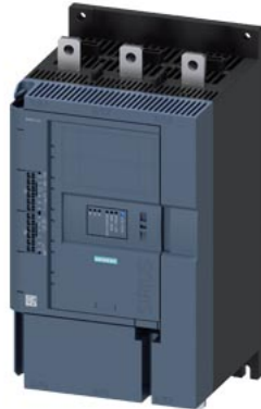
SIRIUS soft starter 200-600 V 210 A, 110-250 V AC spring-type terminals Thermistor input