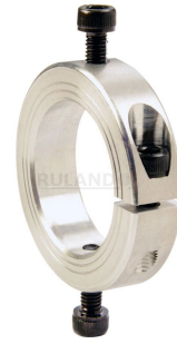
*Additional hardware NOT included