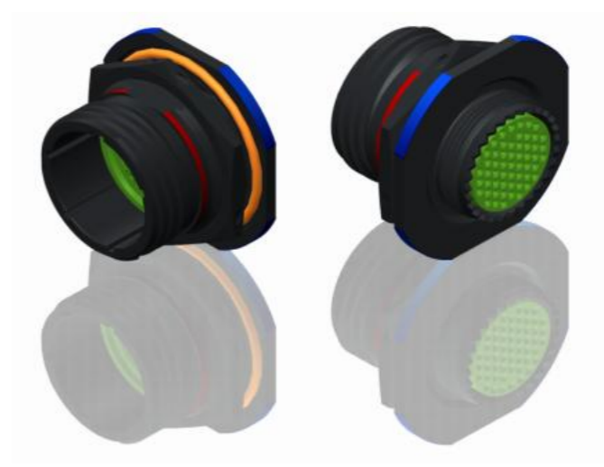
LAYOUT SHOWN AS EXAMPLE