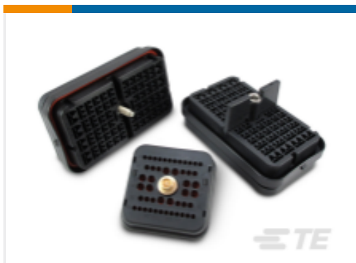
TE Part #DRB12-48PBE-L018 DEUTSCH DRB Housings