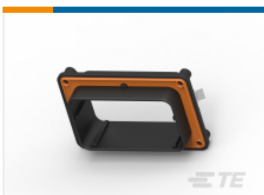
TE Part #DRBF-2B DEUTSCH DRB Mounting Accessories