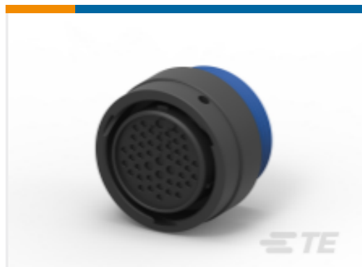
TE Part #YHDP26-24-47SEL024 PLG, 47P, BLK, E, WTHD, 16/20, s