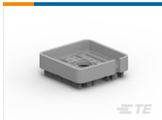
TE Part #WB-51PAL DEUTSCH DRB Wedgelocks