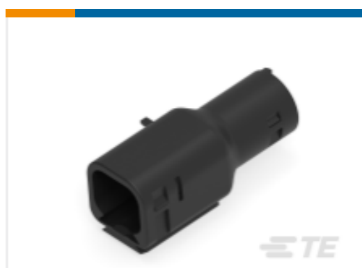
TE Part #1028-027-0405 BKSHL, 4P, BLK, REC, ST, NW 8.5