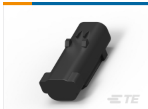
TE Part #2040594-1 SEAL CAP HSG 2P, AMPSEAL16 SEA