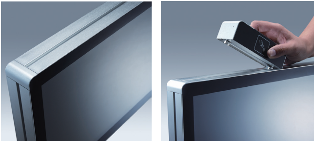
Side groove design for Flexible peripheral device