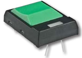
JF Series spot illuminated tactiles will have LED revisions.

1. The LED specifications for JF Series spot illuminated tactile switches will be undergoing changes. This will result in revisions to the electrical values, and will apply to red, yellow and green LEDs for standard or custom switches. Following is the comparison between the specifications before and after the changes. Effected standard part numbers are on page 2.