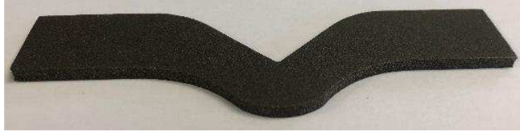
Figure 2: A standard sample of ECE material cut in preparation for Tear Strength Testing.

Five 90° bent samples (Die C) are cut from standard moulded sheet stock of the appropriate ECE material at a nominal thickness of 2.0mm.