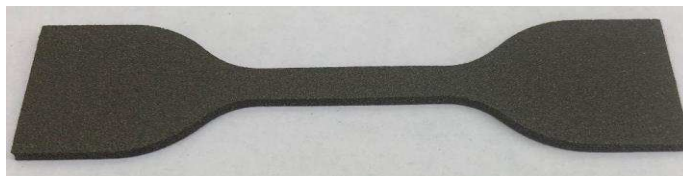
Figure 1: A standard sample of ECE material cut in preparation for Tensile Strength & Elongation Testing.

Five dumbbells shaped (Die C) samples are cut from standard moulded sheet stock of the appropriate ECE material at a nominal thickness of 2.0mm.