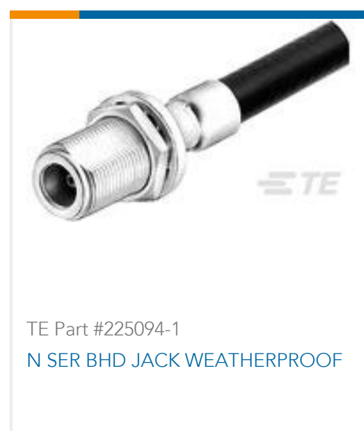
TE Part #225094-1 N SER BHD JACK WEATHERPROOF