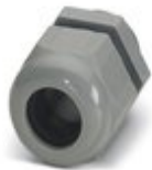
Cable gland, cable gland material: PA, external cable diameter 11 mm ... 17 mm, shielding: no, connecting thread: M25 x 1.5, color: silver-gray RAL 7001

Cable gland - G-INS-M25-M68N-PNES-GY - 1411126