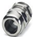
Cable gland, cable gland material: Nickel-plated brass, external cable diameter 11 mm ... 17 mm, shielding: no, connecting thread: M25 x 1.5, color: silver, with O-ring

Cable gland - G-INS-M25-M68N-NNES-S - 1411165