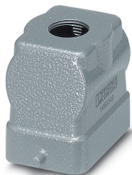
HEAVYCON B6 sleeve housing, for single locking latch, height: 56 mm, with 1 x M25 thread, straight cable outlet

Please be informed that the data shown in this PDF Document is generated from our Online Catalog. Please find the complete data in the user's documentation. Our General Terms of Use for Downloads are valid ( http://phoenixcontact.com/download )