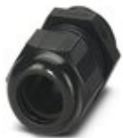
Cable gland, cable gland material: PA, external cable diameter 11 mm ... 17 mm, shielding: no, connecting thread: M25 x 1.5, color: jet black RAL 9005

Cable gland - G-INS-M25-M68N-PNES-BK - 1411134