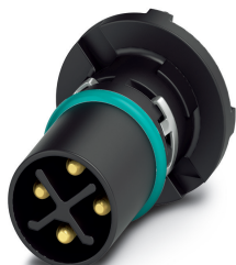
Flush-type connector, Universal, 4-position, Plug, straight, S power, PCB mounting, THR solder connection

Please be informed that the data shown in this PDF Document is generated from our Online Catalog. Please find the complete data in the user's documentation. Our General Terms of Use for Downloads are valid ( http://phoenixcontact.com/download )