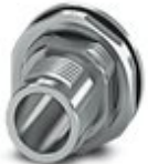
M12 SPEEDCON housing screw connection for M12 male inserts, with O-ring, for all SPEEDCON-capable THR and wave soldering contact carriers

Housing screw connection - SACC-BP-M-M12/M15-6-THR SCO - 1413999