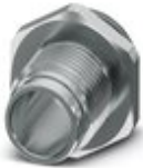
Housing screw connection, Plug, M12-Push-Pull, Front mounting, THR- und Wellenlötkontakte

Housing screw connection - SACC-FP-M-M12-THR PP - 1027679