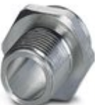
M12 pin, front mounting THR with M14 screw fastening

Housing screw connection - SACC-DSIV-M12-PLUG-9 THR - 1417984