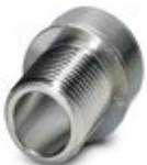
M12 pin, housing screw connection, press-in version, for all Speedcon-compatible THR and wave soldering contact carriers

Housing screw connection - SACC-M12 PLUG PRESS - 1437892