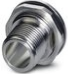
Housing screw connection, Plug, M12, Rear mounting, M15 x 1

Housing screw connection - SACC-BP-M-M12/M15-7-THR - 1413996