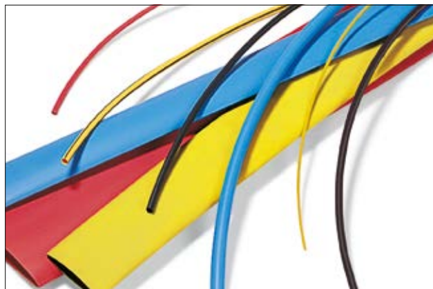
TF21 – available in a wide range of colours and sizes.