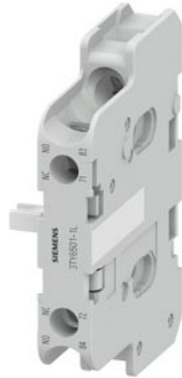
2nd auxiliary switch block on the right, for 3TB46...3TB50