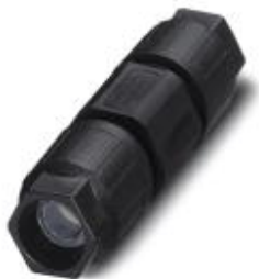
QUICKON cable connector, black, 3+PE-pos., 0.75 mm 2 ... 1.5 mm 2 /500 V/15 A, for a cable diameter of 6 mm ... 12 mm.

Please be informed that the data shown in this PDF Document is generated from our Online Catalog. Please find the complete data in the user's documentation. Our General Terms of Use for Downloads are valid ( http://phoenixcontact.com/download )