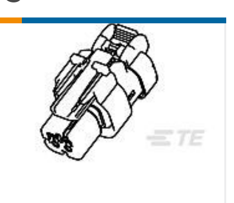
TE Part #776427-1 AS 16, 2P PLUG ASSY, KEY 1