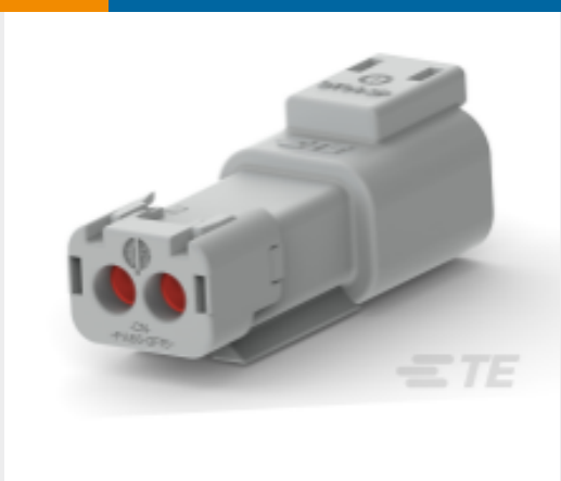
TE Part #DT04-2P-CE03 DEUTSCH DT Receptacle Connectors