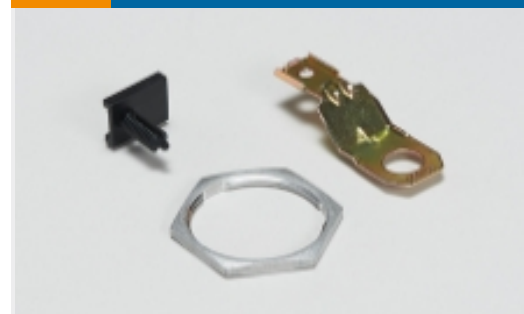
Other Automotive Connector Accessories(16)