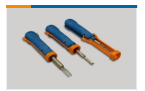
Insertion & Extraction Tools(3)