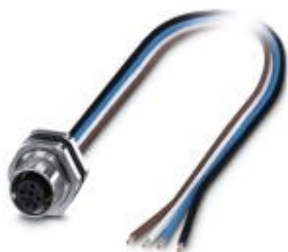
Flush-type connector, Universal, 5-position, Socket, M12, B-coded, Rear mounting, M16 x 1.5, Individual wires, cable length: 0.5 m

Please be informed that the data shown in this PDF Document is generated from our Online Catalog. Please find the complete data in the user's documentation. Our General Terms of Use for Downloads are valid ( http://phoenixcontact.com/download )