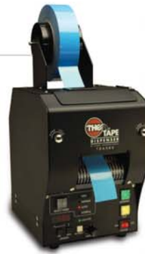
PROGRAMMABLE 5 LENGTH MEMORY