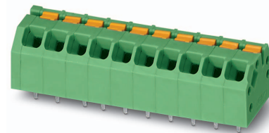
The figure shows 10-pos. standard item (without EX marking)

PCB terminal block, Push-in spring connection