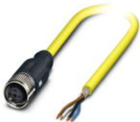
Sensor/actuator cable, 4-position, PVC, yellow, shielded, free cable end, on Socket straight M12 SPEEDCON, cable length: 10 m

Please be informed that the data shown in this PDF Document is generated from our Online Catalog. Please find the complete data in the user's documentation. Our General Terms of Use for Downloads are valid ( http://phoenixcontact.com/download )